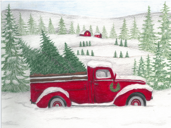
Honorable Mention 9th-12th- Ava Butera , 12th grade, Grand Traverse Academy