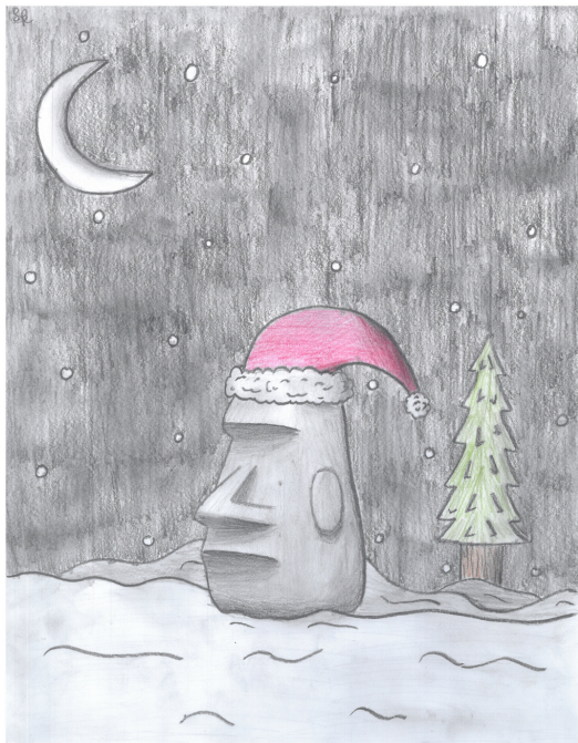
Judge's Choice- Lincoln Klooster - 6th grade, Grand Traverse Academy