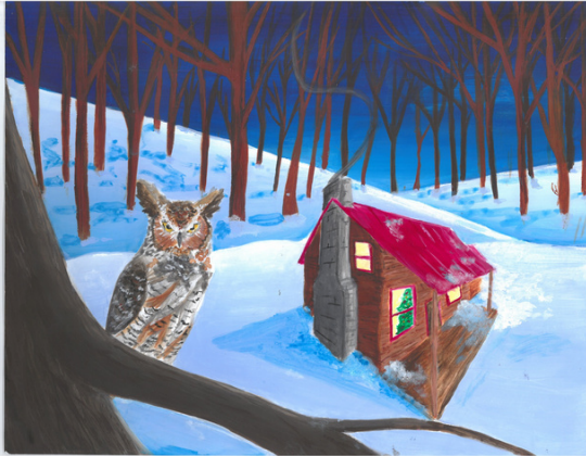
Winner 9th-12th- Dana Bacon , 12th grade, Grand Traverse Academy