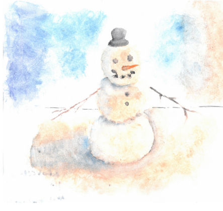
Honorable Mention 9th-12th- Liv Lovelace , 9th grade, North Central Academy